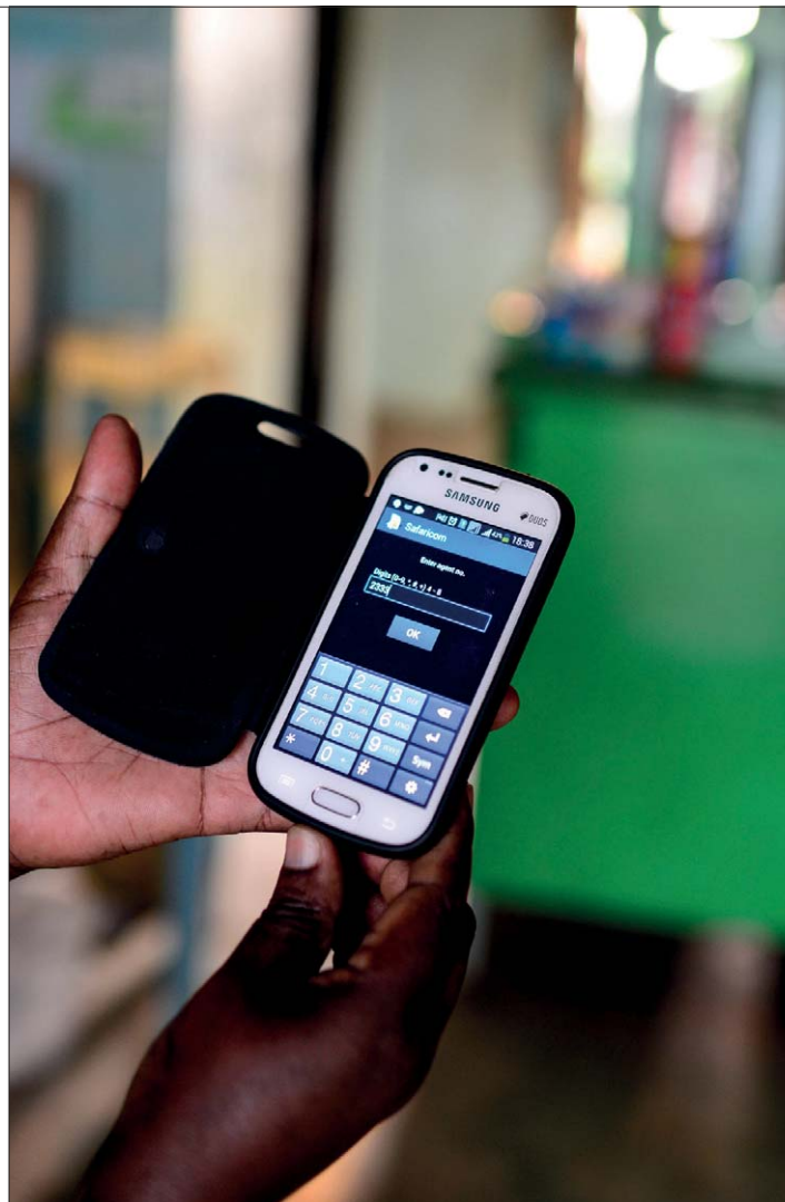
Right: M-Pesa payment by mobile phone in rural Siaya county, Kenya.

Looking at geopolitical changes with a strong pivot towards truly African independence, it's only a matter of time before the continent sees the emergence of homegrown brands that appeal to customers across the continent's many countries and regions. ■